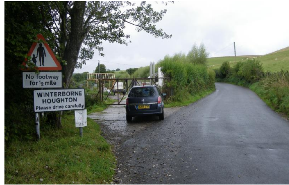
Entrance to the village -Two major accidents here and regular 'near misses' caused by traffic travelling too fast

The village street is approximately 1150 metres in length with housing on either side, some with gardens to the front and others which immediately front the road. As previously mentioned, there are no pavements. The average width of the road is 3 metres and access can be further restricted by parked vehicles.