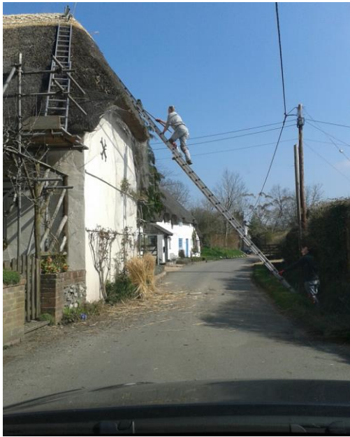
'Men at Work!'

The following photographs illustrate some of the vulnerable road users