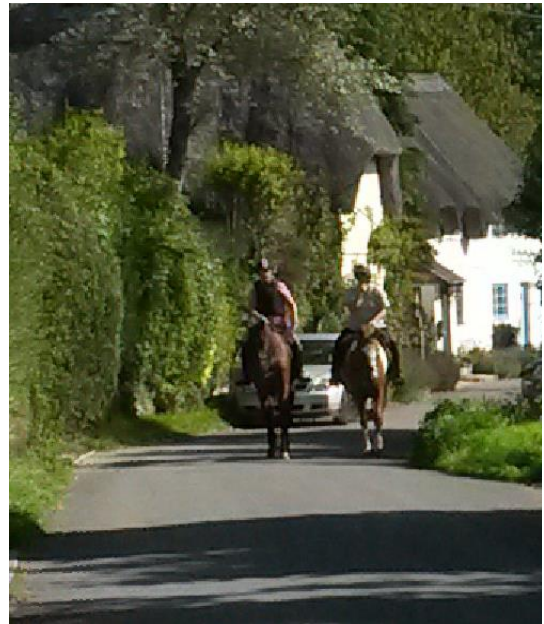
'Local Horse Riders'