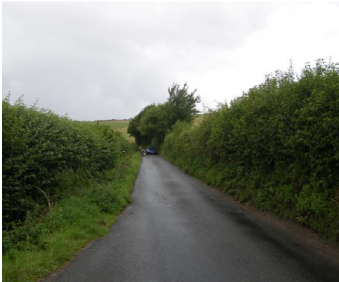
Water Lane - looking towards W Houghton. Traffic tends to speed up along this section after leaving W. Stickland

attributed to excessive speed. There are regular close encounters between vehicles attempting to enter or leave the village and travelling too fast.