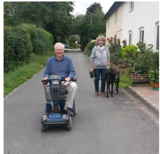
'Some with 4 wheels - some with 4 paws'

In conclusion the Winterborne Houghton Parish Council, on behalf of the village residents, request Dorset District Council to implement a 20 or 30mph speed limit throughout the residential area. What is beyond all shadow of a doubt is that Winterborne Houghton is in desperate need of a speed limit. Although not directly part of the consultation, consideration should also be given, as possibly a better alternative, to extending the 30 mph limit from the end of West Street in Winterborne Stickland to terminate at the end of Winterborne Houghton. This may well be the simplest and cheapest option and would be very acceptable to the residents.